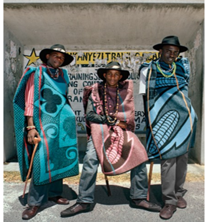
From the series 'A New Beginning'

© Araminta de Clermont, Cape Town, South Africa, 2009–2010