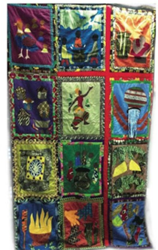
The Unity Quilt by http://www.amaniafrica.org

FREE! 2 hours free validated parking in Citi Plaza during library hours.