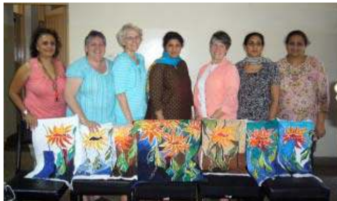
Sunflower Workshop: Participants show off their new skills

This was the most intense workshop, Featuring raw edge appliqué worked from the back of the foundation fabric. Three Ladies Quilt Project, Class Participants above.